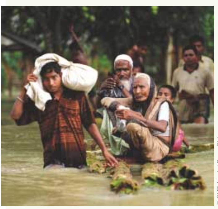
Development gains washed away: community displaced by flooding Bangladesh

Locally, impacts on poverty and food security can be much more severe and may not appear in national statistics. Disasters stretch coping strategies to breaking point and have long-term effects on livelihoods. High frequency hazards such as drought trigger immediate food crises, but can also have longer-term 'ratchet' effects which impede recovery in interim periods, especially when combined with other pressures such as HIV/AIDS, poor governance and conflict.