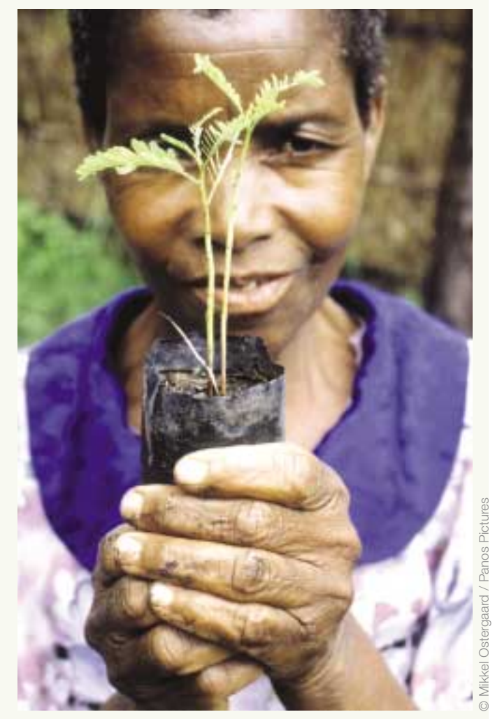
Reducing the risk: woman working on reforestation project

Humanitarian responses to disaster impacts now cost Development Assistance Committee (DAC) donors an annual US$ 6 billion or seven percent of total official development assistance (ODA) flows, and this proportion is rising. Yet disaster-related costs to development run much deeper than this.