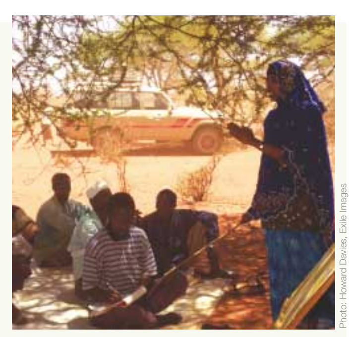
Capacity building: Identifying risks, and how to address them, with the community Kenya