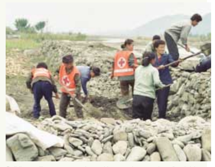
Building resilience: community working together to reduce flood risk North Korea

There are many entry points whereby bilateral donors can promote disaster risk reduction in international and national development agendas.